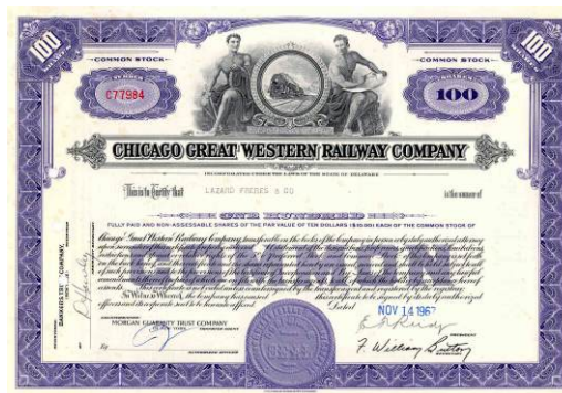
Figure 1: Chicago Great Western Railway Company common stock

This means that a common stock owner is the owner of a fraction or share of a company. Stocks owners are called shareholders or stockholders . There might be a (usually legal) difference between those two, but in the context of this document, stockholders and shareholders are identical and both words will be used with the same meaning.